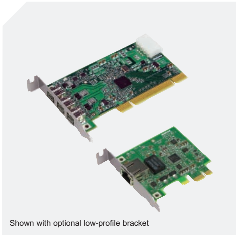
Shown with optional low-profile bracket

Family of Gigabit Ethernet NICs and IEEE 1394b adaptors.