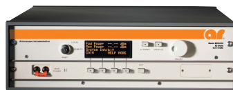
40T18G26A ( pdf spec )

Photo shown with the AP5010B antenna positioner (not included)