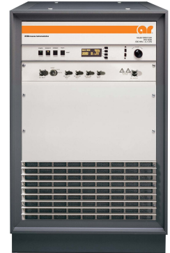
200S1G4A ( pdf spec ) Microwave Amplifier 0.8 - 4.2 GHz 200 Watts 2 Year Warranty 45% SAVINGS!

Photo shown with the AP5010B antenna positioner (not included)