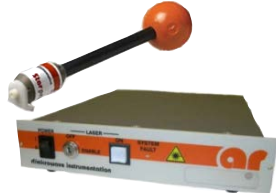
FA7040/Kit ( pdf spec ) Electric Field Analyzer Kit 2 MHz - 40GHz, 10 - 1000V/m 30% SAVINGS!

*Product shown with cabinet. Bargain corner unit sold without cabinet.