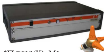
*FL7030/Kit M1 Field Probe Kit ( pdf spec ) 5 kHz - 30MHz, 1.5 - 300V/m 30% SAVINGS!

For a full AR Bargain Corner listing, click here .